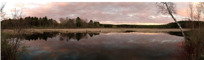
Post Farm Marsh: Protected, 231 Acres