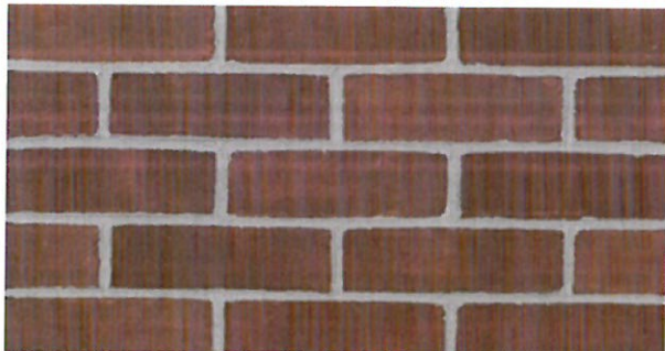
52-DD Red Molded Facebrick | Cushwa Calvert Series | Glen-Gery glengery.com

The two proposed options are Glen-Gery 52-DD and Glen-Gery 53-DD