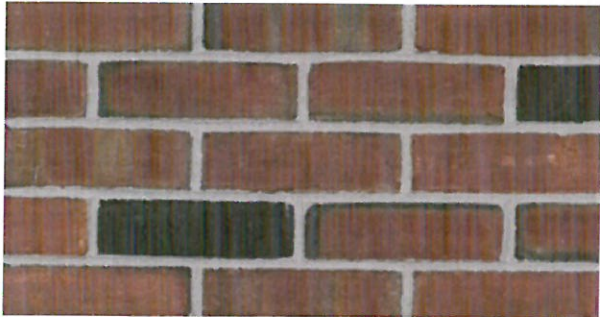
53-DD Red Facebrick | Sand Struck Finish | Glen- Gery glengery.com